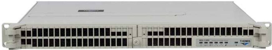
RES-11XR3 shown with optional front panel dust filters